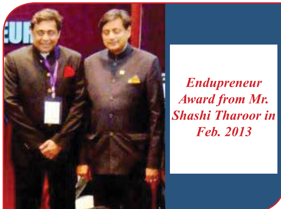
Endupreneur Award from Mr. Shashi Tharoor in Feb. 2013