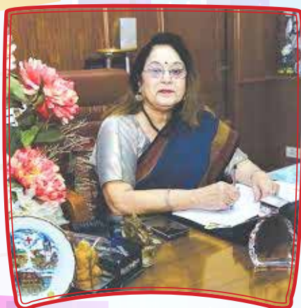
Patron and Chairperson of Mahima Shiksha Samiti

“Education is the passport future, for tomorrow belong to those who prepare for it today” -Malcolm X