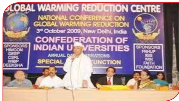
Vocational Education Entrepreneurship Research (VEER) Award in 2009