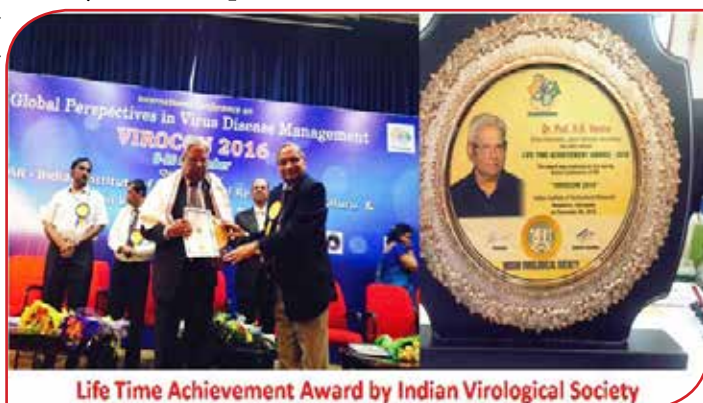
Life Time Achievement Award by Indian Virological Society