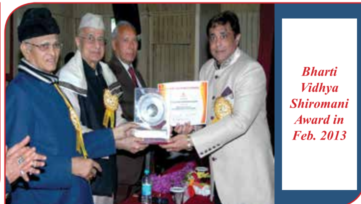
Bharti Vidhya Shiromani Award in Feb. 2013